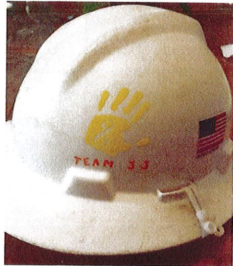
Helmet/Hard Hat Decal